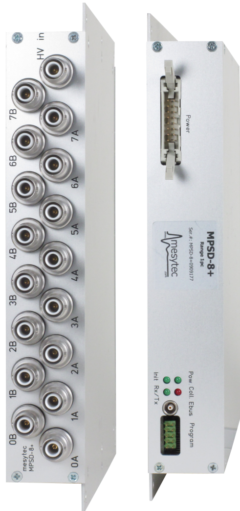
Standalone housing of MPSD-8+ in NIM case with mounting flaps

In any case it comes in a 1/12 NIM size case (164 x 250 x 34mm 3 plus SHV connectors of 20mm).