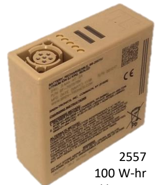
2557 100 W-hr internal battery

20210218 Specifications subject to change