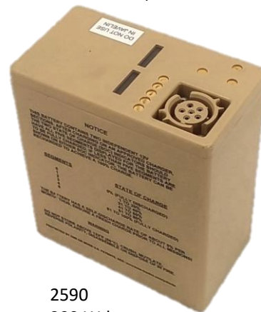
2590 300 W-hr external battery